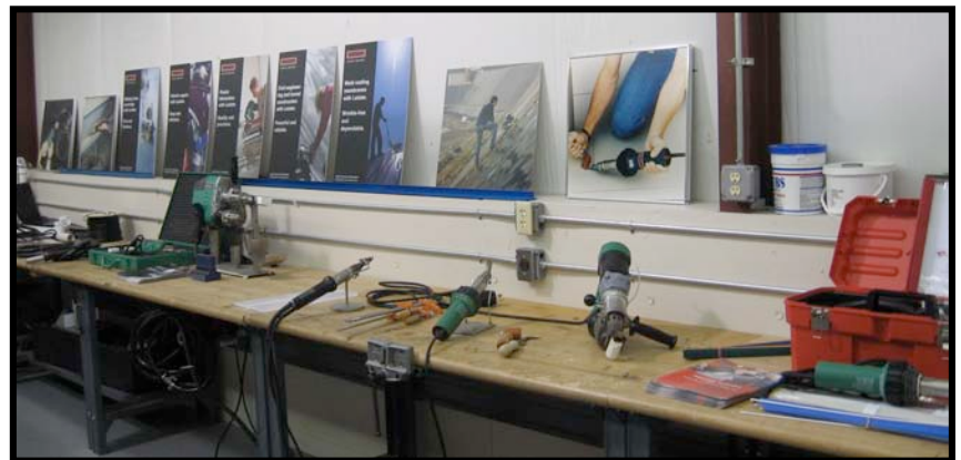
Plastic welding with hand held heat guns area