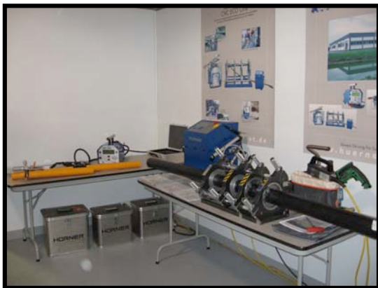
Electrofusion Pipe welding area

Demonstrated were welding banners, plastic welding fabrication, battery powered heat guns for shrinking and soldering, battery powered soldering irons and a wide assortment of heat guns and stainless nozzles used to precisely direct the airflow from the heat guns.