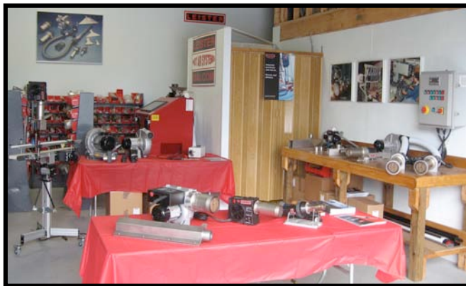
Process heating area

We had demonstrations on going throughout both days including: Process heating systems including hot air blowers, heat sources and process heating control systems.