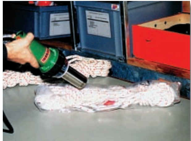
Shrinkwrapping of safety ropes with ELECTRON hot air blower.