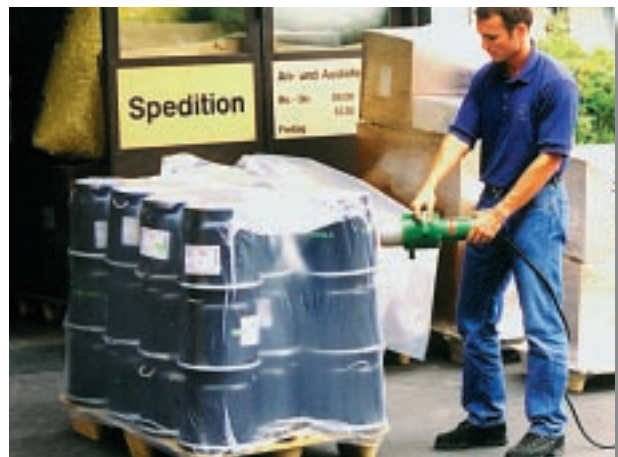
Flamless shrinkwrapping of pallets and bulky items with FORTE S3 for transportation. Working in closed rooms possible.